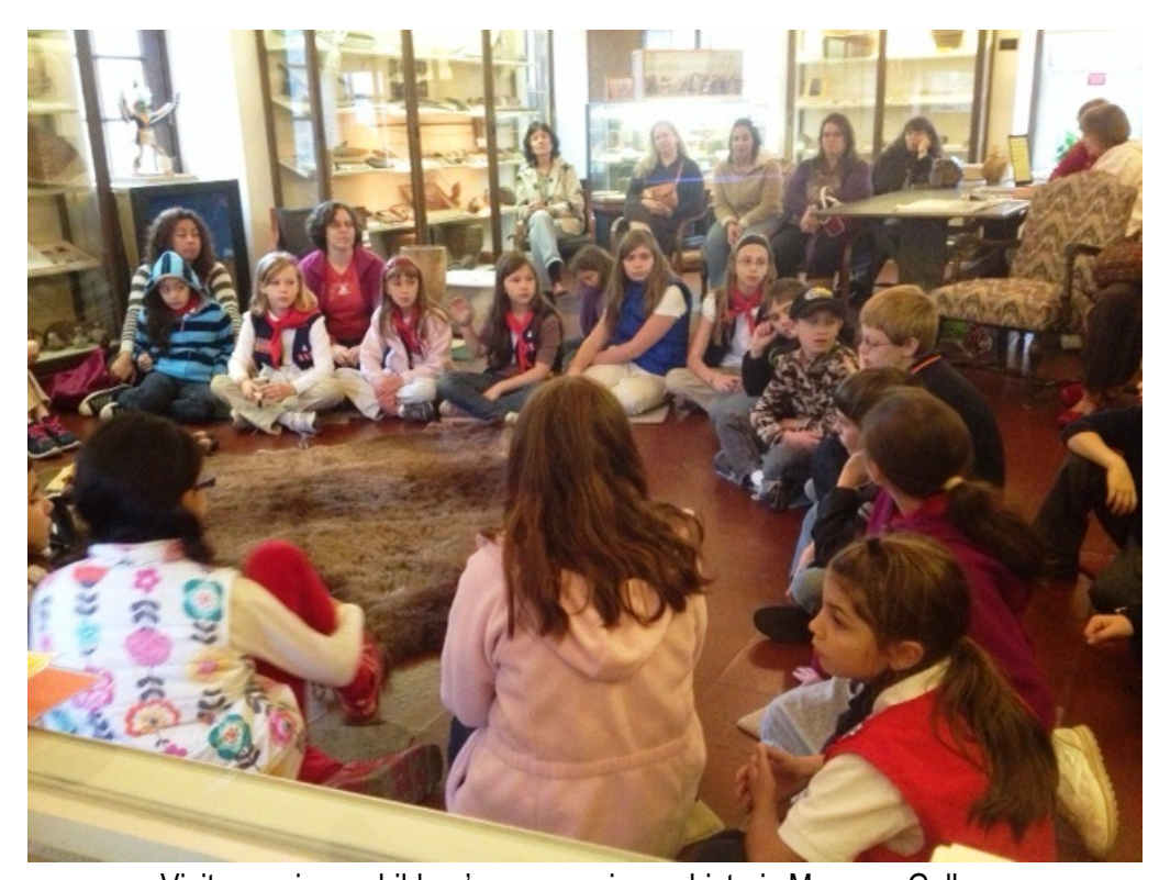
Visitors enjoy a children's program in our historic Museum Gallery.